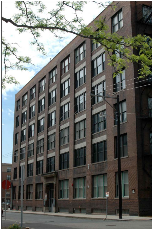
Photo: The O'Donnell Shoe Company (1914) project in St. Paul is preserving this important historic structure, while providing affordable workforce housing. Aeon is the developer for the project known as the Renaissance Box.