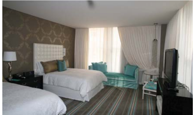
An interior view of a room at the Nines Hotel.

More broadly, the project demonstrates that sustainable practices and luxury hotel operations are not mutually exclusive, but that "eco-luxury" is mutually compatible.