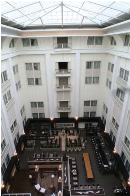
An interior view from a balcony at the Nines Hotel.

The Oregon National Guard Armory Annex, built in 1891, has thick masonry walls and a fortress-like appearance, and with more gun slits than windows it might not seem like an obvious candidate for a green rehabilitation. But the Gerding Edlen Development Company had a vision to rehabilitate this historic building into a state-of-the-art theatre while meeting the Secretary of the Interior's Standards for Rehabilitation and achieving LEED Platinum certification, the highest level in the LEED program.