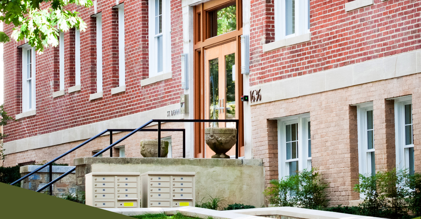
St. Dennis Apartments in Washington, D.C.