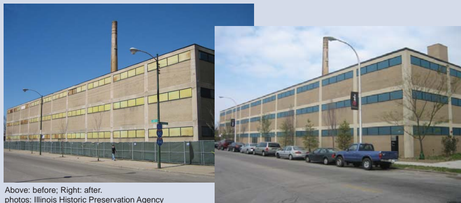
Above: before; Right: after.

Formerly the Illinois Institute of Technology's Chemistry Research Building, this 1959 era building was purchased by a private company for redevelopment. Using the Federal historic tax credits, it became the new home for a wet-and-dry-lab-capable research and development facility. Work to accommodate future tenants included installation of a new atrium, exterior wall and window renovations, and new mechanical, electrical and plumbing services. The creation of an atrium provides a more modern, open interior and natural light that meets modern tenants' expectations as well as allowed the primary facades to be preserved.