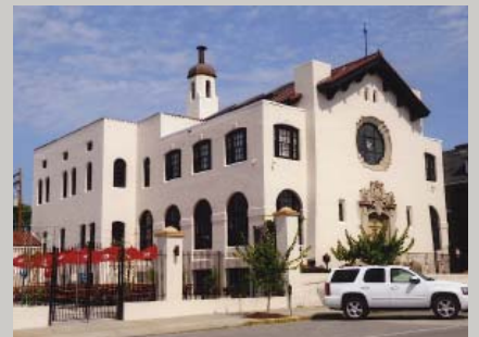
Central States Life Insurance Co. Building, St. Louis, MO