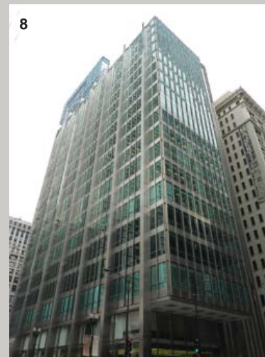
1. Chase Grain Elevator, Sun Prairie, WI; 2. Sengelmann Hall, Schulenburg, TX; 3. Cincinnati Color Building, Cincinnati, OH; 4. Carlin's Amoco Station, Roanoke, VA; 5. Breakwater Hotel, Miami Beach, FL; 6. Croke Patterson-Campbell Mansion, Denver, CO; 7. Old Masonic Temple and City Hall, Vallejo, CA; 8. Inland Steel Building, Chicago, IL. All photos NPS files.