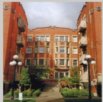
Trinity Place Apartments, Portland, OR