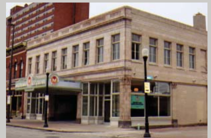
The Rialto Theater, Cleveland, OH

The former Central States Life Insurance Company Building recently became the headquarters of Chameleon Integrated Services (CSI), a St. Louis, MO-based information technology firm, following a $3 million rehabilitation. Individually listed in the National Register, this 1921 Mission Revival-style building was designed for a local corporate headquarters, complete with an impressive two-story atrium. Later used for many purposes, and most recently as a series of nightclubs, CSI purchased the building and returned it to its original use as corporate offices. The building's exterior and surviving historic features on the inside were restored, and state-of-the-art security systems installed. Twenty-seven percent of the work was completed by minority-owned businesses from Greater St. Louis. With their new offices and a building rich in architectural detail, CSI has not only saved an impressive historic resource, but also is contributing to the rebirth of the local community.