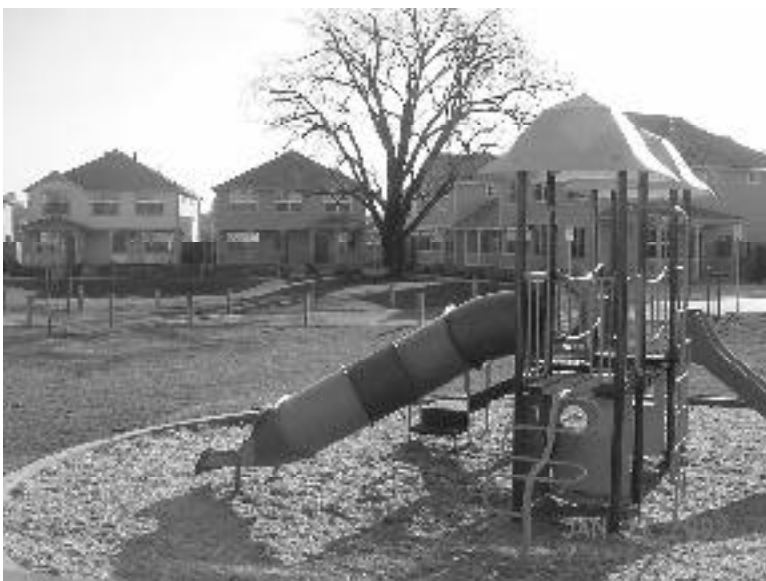
Petaluma, a small city which earned a place in the Honor Roll on the Housing Crisis Report Card , is the site of this attractive new community. Called Old Elm Village, it was developed by Burbank Housing Development Corporation to provide 87 apartments and townhouses near downtown Petaluma. Families at Old Elm Village earn between 30% and 80% of area median income. The City of Petaluma provided part of the financing for this mixed-use, infill development.

When local housing elements were compared with the vision of housing choices for all, it was clear that some communities are leading the way out of the crisis with common sense approaches described in the sections below. However, the majority of Bay Area cities and counties are declining to take simple steps that would double affordable housing production. Their housing elements are far from visionary. Other cities have not even finished a housing element for the 1999-2006 period, despite the statutory deadline of December 31, 2001. (See Appendix B for the status of every Bay Area jurisdiction's housing element.)