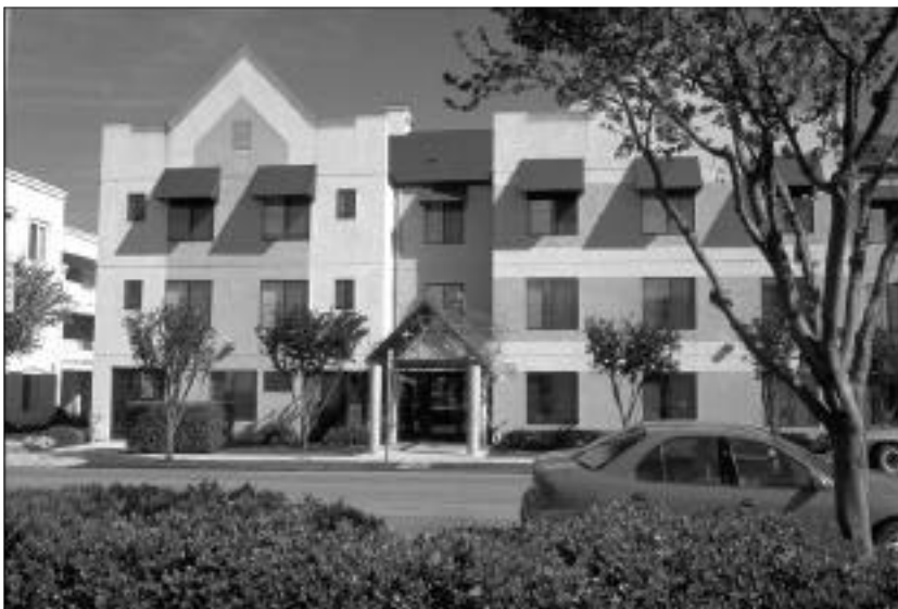
The Carroll St. Inn near Sunnyvale’s town center offers affordable housing to people with very modest incomes, including single people living and working in the community, seniors on fixed incomes, and single parents with one child. Its 119 mini-studios were developed by Mid-Peninsula Housing Coalition. Financial assistance from the City of Sunnyvale—which made the Housing Crisis Report Card Honor Roll—helped make the Carroll Inn a reality.

The housing element grading system was developed by the Nine County Housing Advocacy Network, a unique grouping of housing service providers, advocates, legal professionals, smart growth environmentalists, and representatives of the public sector and faith community. To develop the Report Card , Network members examined what policies and approaches either encouraged or hindered the development of affordable housing locally. These were used as a yardstick to grade housing elements from the Bay Area’s most important housing markets. Therefore, Report Card grades can help