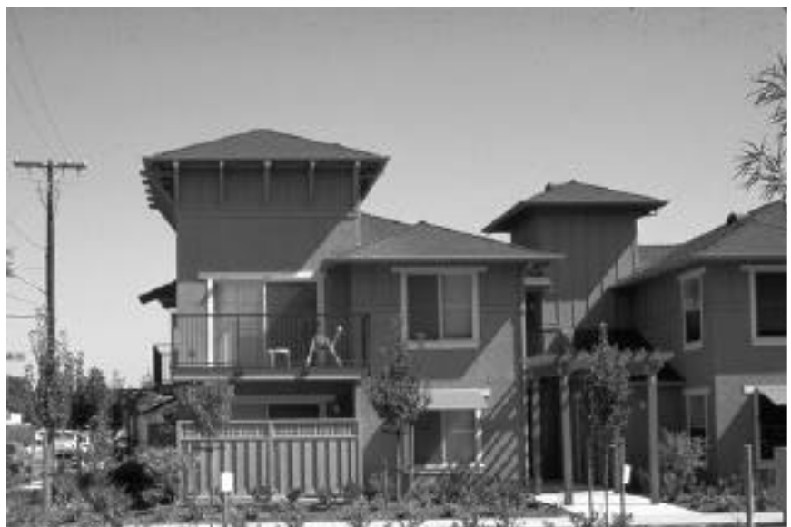
These affordable apartments were built by Mid-Peninsula Housing Coalition in the City of Palo Alto which made the Honor Roll on the Housing Crisis Report Card. They provide housing close to CalTrain for people with developmental disabilities.

However, these facts have not been motivation enough. Only 28% of the 40 key cities and counties analyzed here have housing elements that rated Good or made the Honor Roll. And almost a third have not even completed a housing element that was due last year. The State of California has the power to enact housing element reform—real rewards for cities that are creating their fair share of housing, and real consequences for those refusing to act. The findings of this Report Card suggest that such reform is overdue.