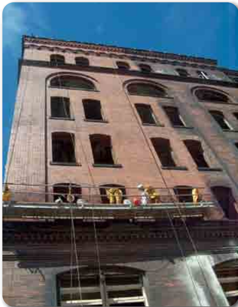
Restoration of the Armstrong Cork Factory was made possible in part by the federal Historic Preservation Tax Credit.