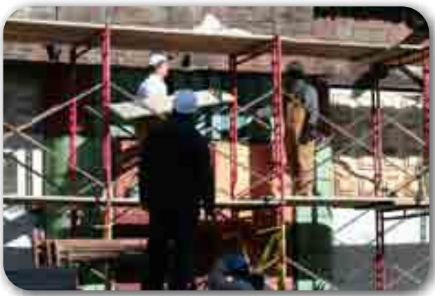
Renovation of the New Granada Theatre in the Hill District