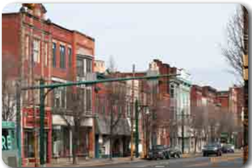
Millions of dollars have been invested in Homestead's Eighth Avenue Historic District