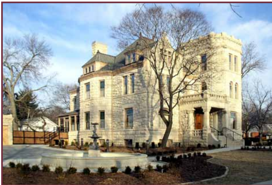
Castle Tea Room, Lawrence, Kansas

While the KHTC is geographically dispersed in Kansas, locations where