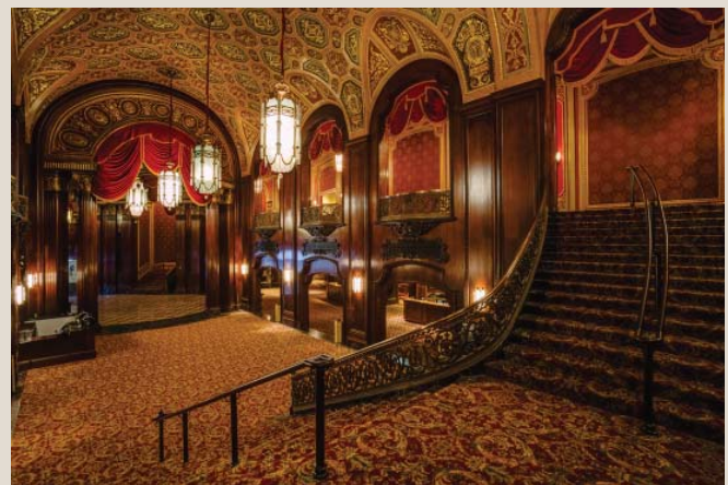
After photo of lobby: Kings Theater