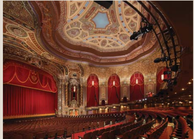
After photo of auditorium