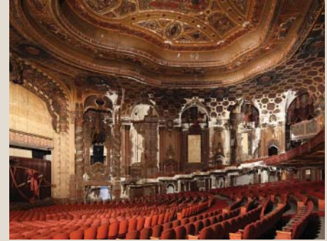
Before photo of auditorium: Whitney Cox

Utilizing the Federal Historic Tax credits, this successful public/private partnership brought the magnificent building back to life. The $95 million project was certified by the National Park Service in 2015 with a QRE. The rehabilitation generated over 500 construction jobs, with 100 full-time positions created with the completion and in-service operation of the building. Today, it is the largest indoor performing arts venue in Brooklyn and fourth largest in New York City.