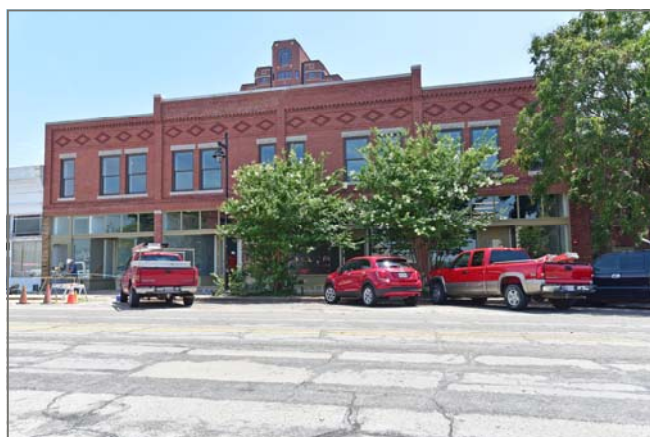
Sharp's Pawn Shop, Bartlesville, Washington County

A tax credit reduces the taxpayers tax liability. That is, the amount of the credit is subtracted from the amount the taxpayer owes the IRS and the OTC. A credit differs from a deduction as the latter reduces taxable income rather than tax liability.