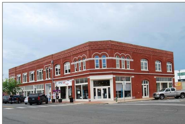
Severs Block, Muskogee, Muskogee County