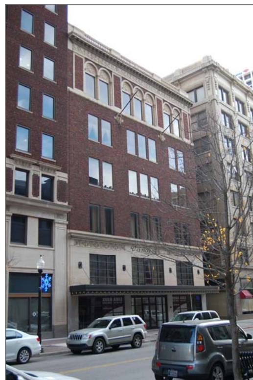
Vandever's Department Store, Tulsa, Tulsa County

The SHPO website with more information and links to the NPS website can be accessed at http://www.okhistory.org/shpo/taxcredits.htm . The NPS website with more information can be accessed at https://www.nps.gov/tps/tax-incentives.htm . The NPS website also contains a link to the IRS regulations at https://www.nps.gov/tps/tax-incentives/before-apply/irs.htm . The Oklahoma Tax Commission can be accessed at https://www.ok.gov/tax/ .