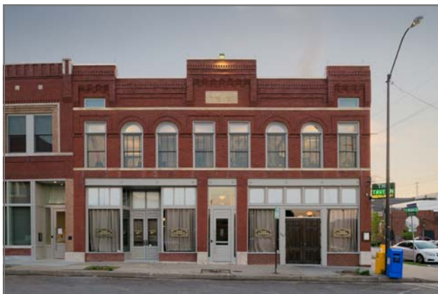
Fox Building, Tulsa, Tulsa County

Before beginning your rehabilitation project, it is strongly advised that you complete the "Historic Preservation Certification Application Part 2" and obtain preliminary certification of your proposed project work. When your project is finished, you complete the "Historic Preservation Certification Application Part 3" to obtain final certification of completed work. Each application phase is to be submitted to the SHPO. The SHPO will process the application and forward it to the NPS for review and approval. The NPS is the only agency that can certify the rehabilitation work.