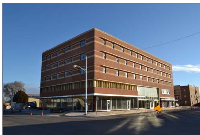
Dale Hotel, Guymon, Texas County