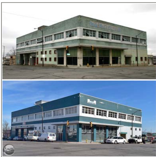
Bill White Chevrolet Complex, Tulsa, Tulsa County