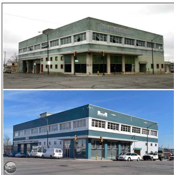
Bill White Chevrolet Complex, Tulsa, Tulsa County

Property owners and developers are encouraged to consult the SHPO about the certification process before making any decisions or taking any actions regarding rehabilitation work. (Warning: To qualify for the 20% tax credit for certified rehabilitation* of a certified historic structure, the applicant must receive NPS written approval (preliminary certification) of the proposed rehabilitation before any construction work begins. Failure to do so, may jeopardize the tax credits for the entire project. Applicants who proceed with rehabilitation work prior to NPS preliminary certification do so at their own risk.)