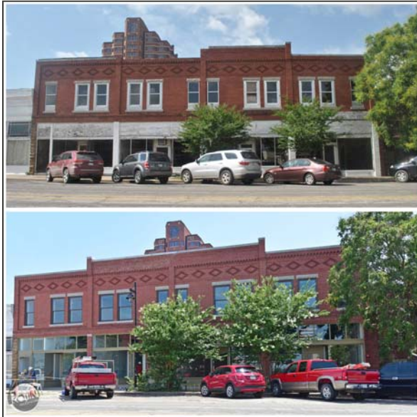
Sharp's Pawn Shop, Bartlesville, Washington County