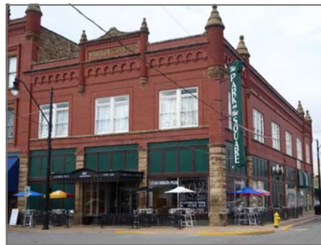
Photos clockwise from upper left: Bryan Hotel, Durant, Bryan County; Parkinson Building, Okmulgee, Okmulgee County; The 424, Oklahoma City, Oklahoma County; and Dale Hotel, Guymon, Texas County